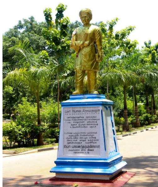
Fig. II - Sir Ponnambalam Ramanathan