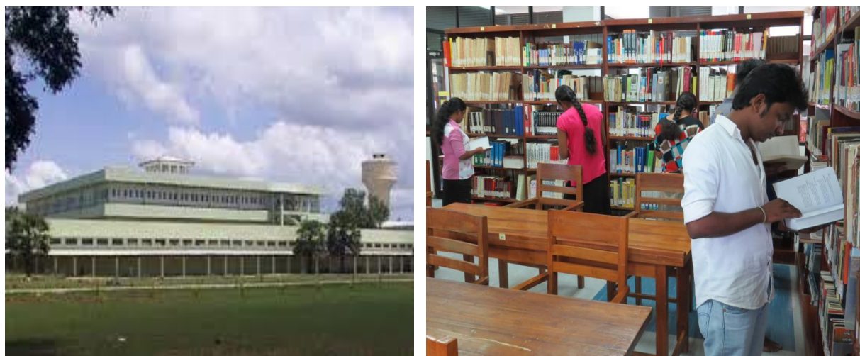
Fig. IX - Vithiananthan Library

Students should return all the books and library tickets issued by the library, upon completion of their course or in case they drop out of the course for any reason. Until all such dues have been settled Clearance letter will not be issued by the library, which in turn delay the issue of Degree certificate for students.