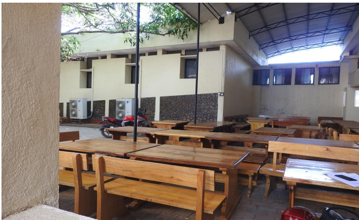
Fig. VI - Student Study Area