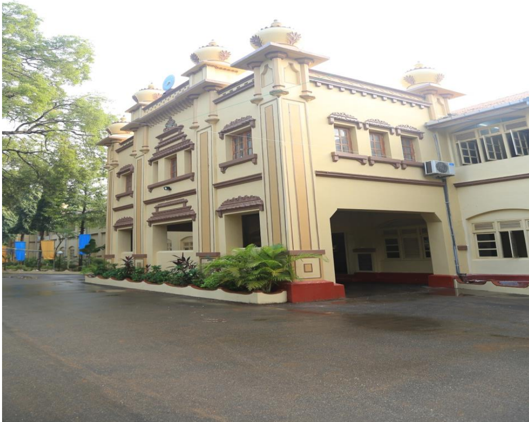
Fig. VIII - Administration Block, University of Jaffna

The Dean's office will entertain students' appeals in a prescribed format