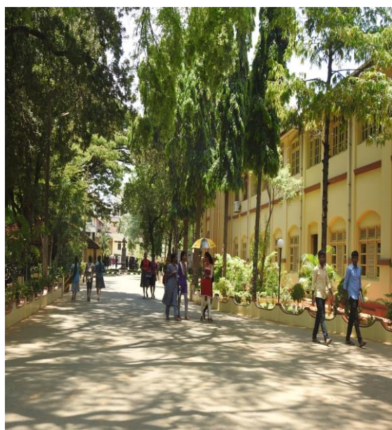
Fig. I - Students' life at the University

The subjects offered for the Bachelor of Arts Honours Degree Programme: Archaeology, Art History, Christian Civilization, Cultural Tourism, Drama and Theatre Arts, Economics, English Literature, Geography, History, Home Economics, Linguistics, Media Studies, Philosophy, Planning, Political Science, Psychology, Sociology, Tamil and Translation Studies.