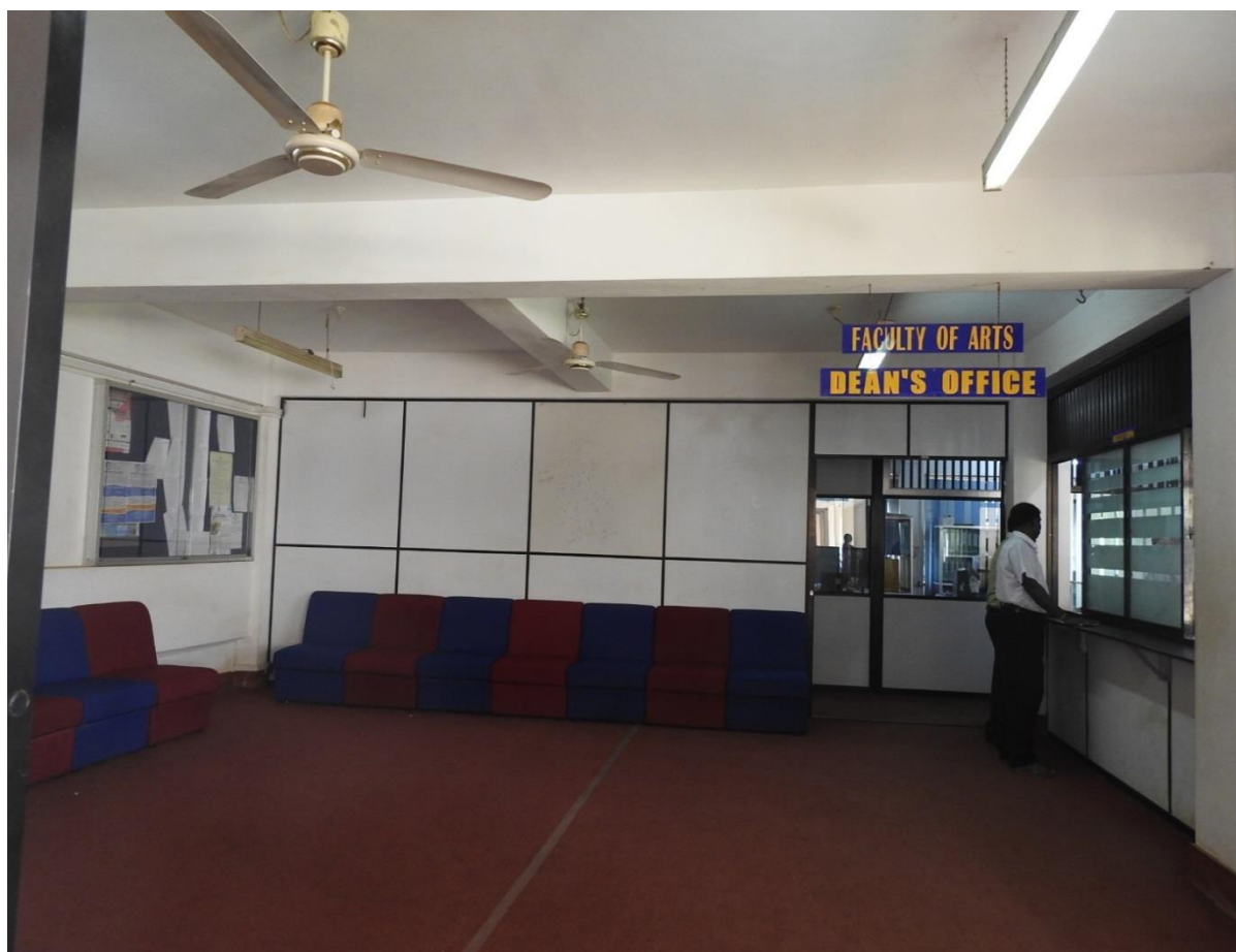
Fig. VII – Lobby area of Dean's Office

Every student shall carry the Identity Card whilst on the University premises and shall produce such Identity Card when called upon to do so by any member of the academic, administrative or security staff of the University.