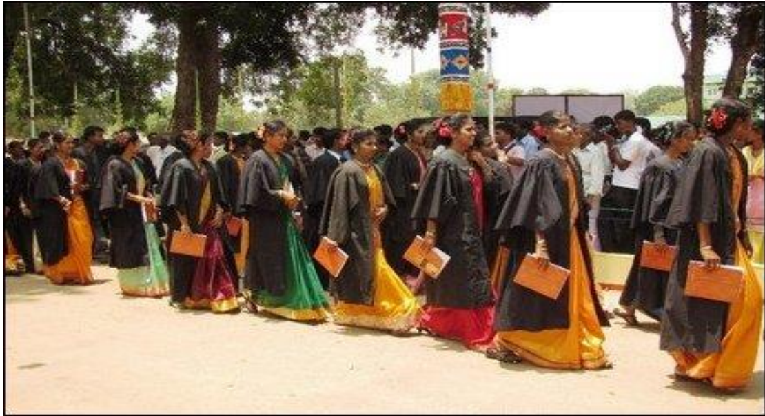
Fig. V - Procession Leads to Convocation